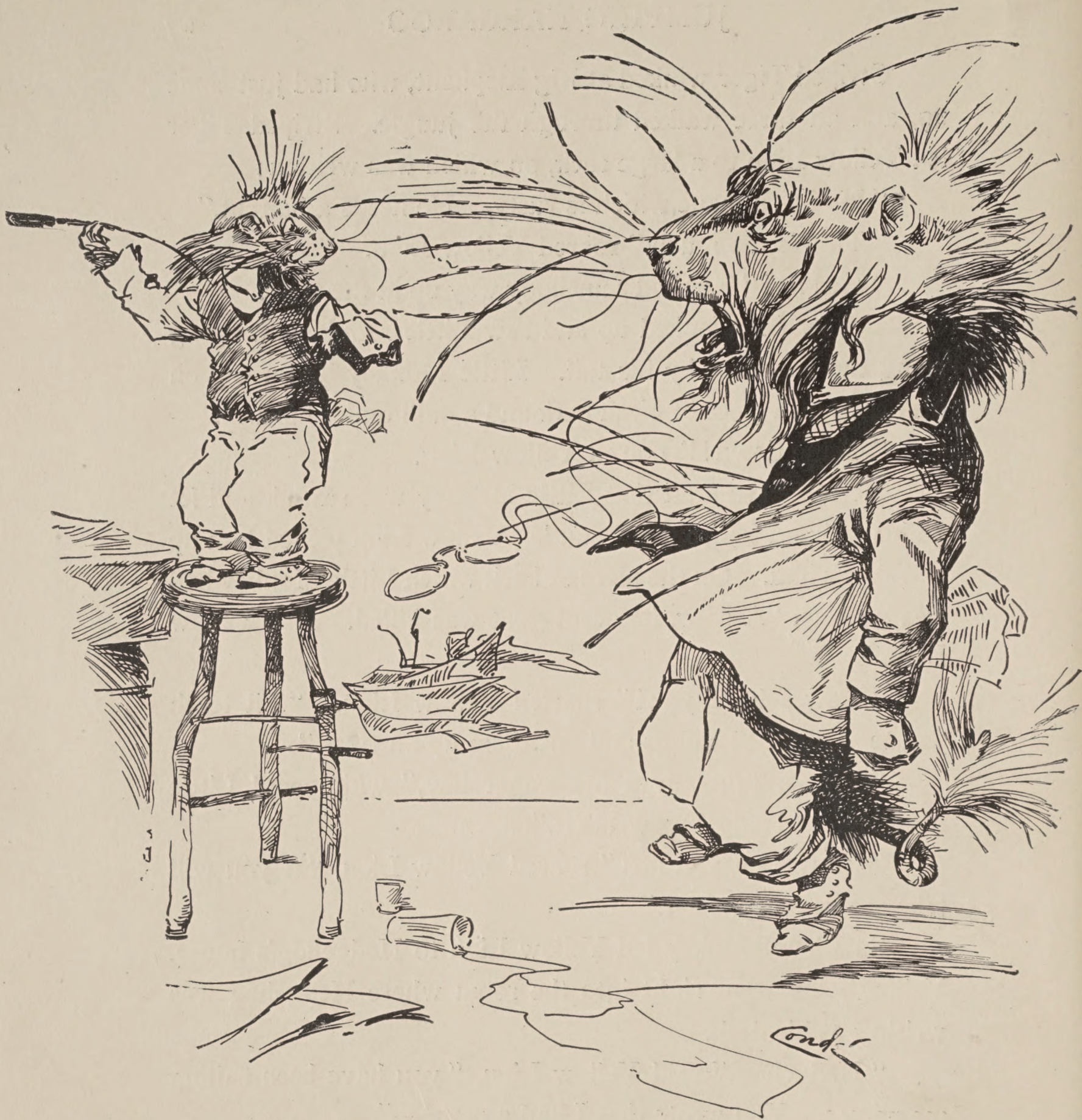
HEDGEHOG DRIVES HIS QUILLS.